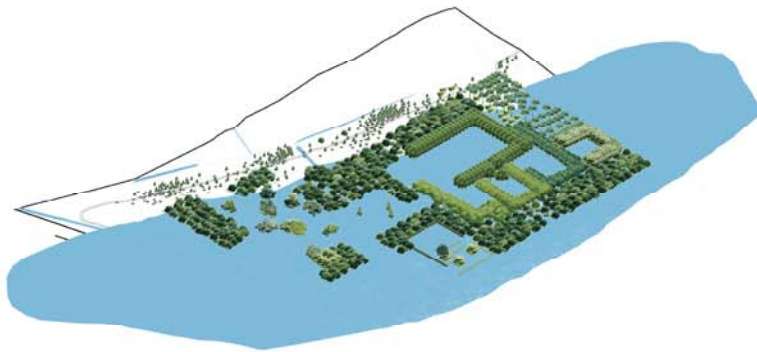
100-Year Flood Event